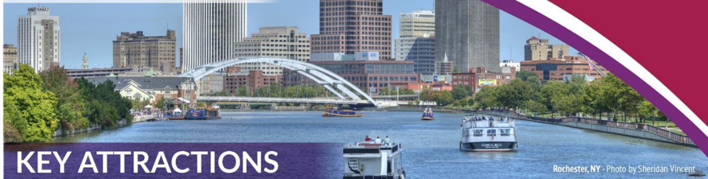
Rochester, NY